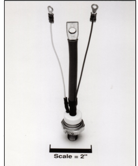
2N1909-2N1792 Phase Control SCR 70 Amperes Average (110 RMS), 600 Volts