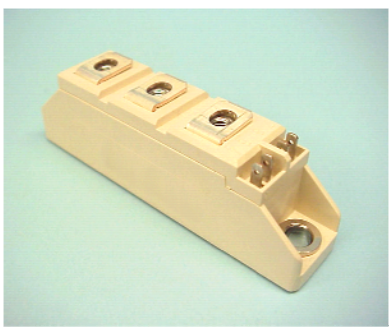
CD43__90B Dual SCR Isolated POW-R-BLOK<sup>™</sup> Module 90 Amperes / Up to 1800 Volts