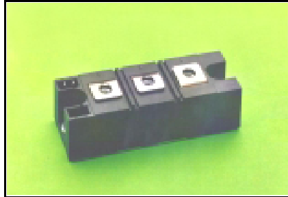
CD62__15A, CD67__15A Dual SCR/Diode Isolated POW-R-BLOK™ Module 150 Amperes / Up to 1600 Volts