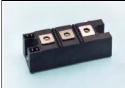
CD63__15A Dual SCR Isolated POW-R-BLOK™ Module 150 Amperes / Up to 1600 Volts