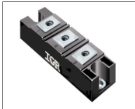
CASE STYLE NEW INT-A-PAK