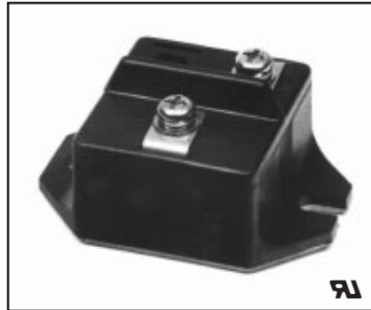
CS240610, CS241210 Fast Recovery Single Diode Modules 100 Amperes/600-1200 Volts